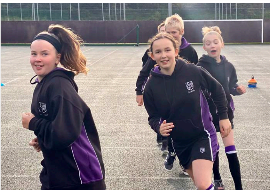
Year 7 Fitness students completing an activity called Time Travel!