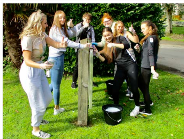
Sixth Form students renovating our slate sign

We are currently putting the finishing touches to a number of guides for students and parents which will help you make the most of mobile devices when accessing the Microsoft Office 365 suite of applications which is available to all students through their school email account login. We will also be recommending a number of applications for mobile devices which students may consider using to help them keep on top of their school work. We are keen to support all of our students to become independent and self organised students and to help them sensibly, and in a healthy way, to