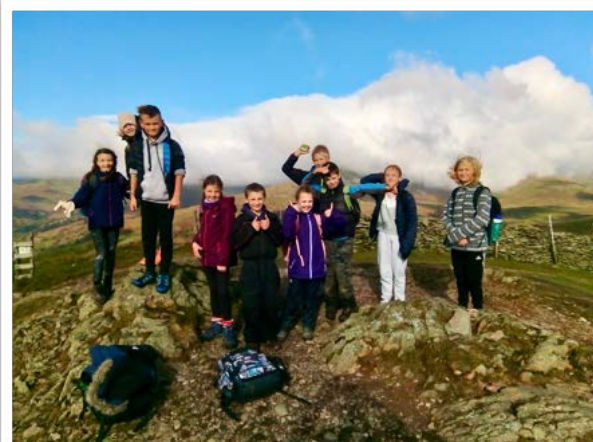
Year 7 on the dizzy heights of Wansfell

incorporate the use of their mobile device into their daily lives. We know from our communications with students that the vast majority of children access Microsoft Teams and other applications solely through a mobile phone or tablet. We see it as our duty to support students in making the most of these applications at a time when a home desktop computer is less common in our households. Whilst a laptop computer is still a popular choice in the home we do recognise that the functionality of mobile devices does now enable our students to access the full range of Microsoft Office 365 applications that they need to complete their school work. We look forward to supporting parents and students through our digital learning webpage and we will email all parents and students once significant updates to that page have been added.